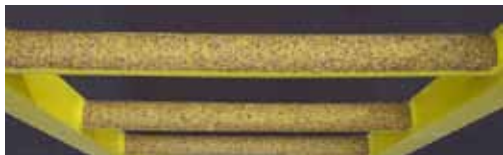
Non-skid UltraGrit™ coated rungs